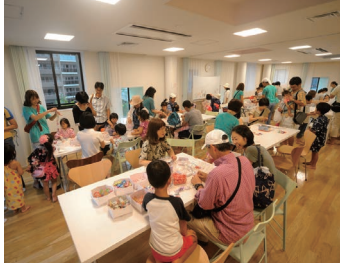
Summer festival workshop