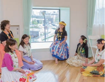
Hula dancing club